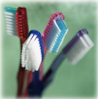
"Restore Medicaid Dental Services"

The Council participated in Disability Advocacy Day at the Capitol Friday, February 8th. Council staff supported a number of self-advocates to meet with their legislators and attend the Joint House and Senate Health & Welfare public hearing. Council staff and members created a basket full of toothbrushes with tags that read "Restore Preventative Dental" and used them to market the idea at the Capitol for the day.